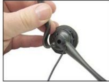
2. Remove headband