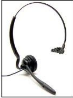
1. From headband configuration