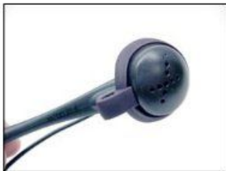
5. Pivot ball ring Installed