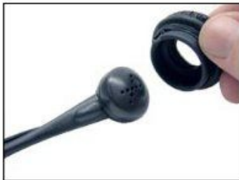
3. Remove cushion ring